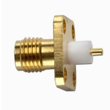
Model 72962 SMA JACK PANEL RECEPTACLE (4 HOLE)

High bandwidth, small size, and durability for confident connections